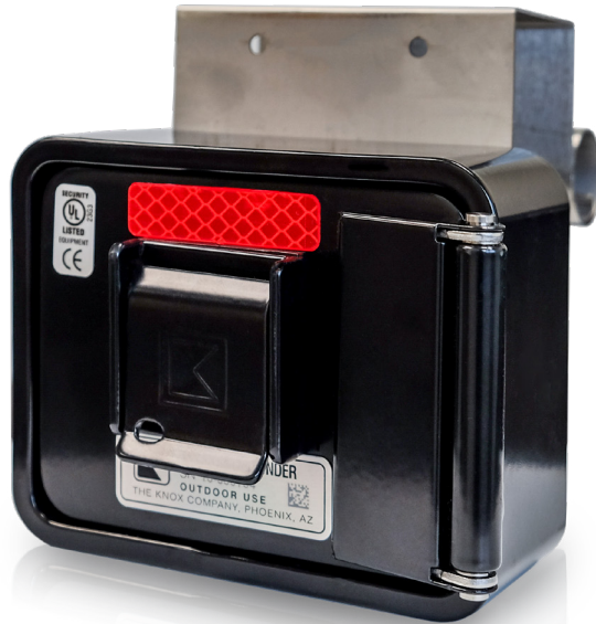
Door Hanger Model #1659