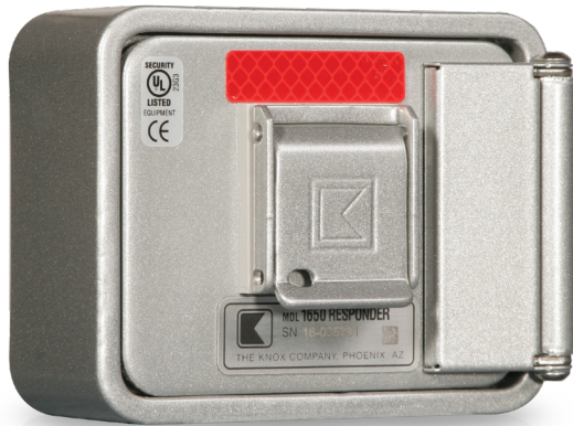
Surface Mount Model #1662