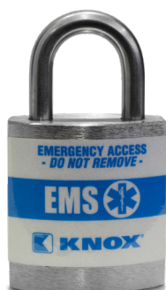
INTERIOR USE Model #3774