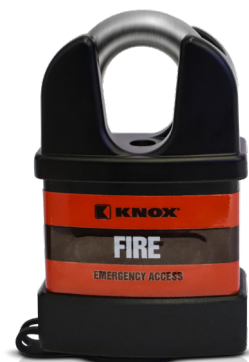
EXTERIOR USE Model #3784