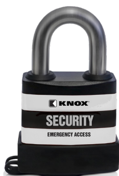
EXTERIOR USE Model #3783