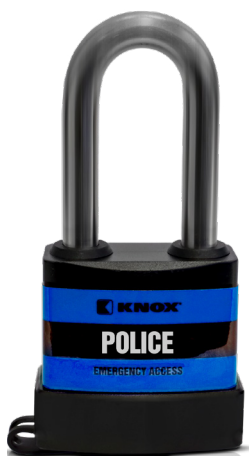
EXTERIOR USE Model #3782