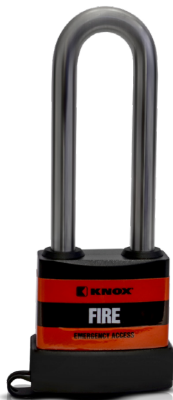
EXTERIOR USE Model #3781