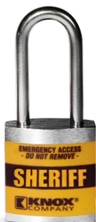
INTERIOR USE Model #3771